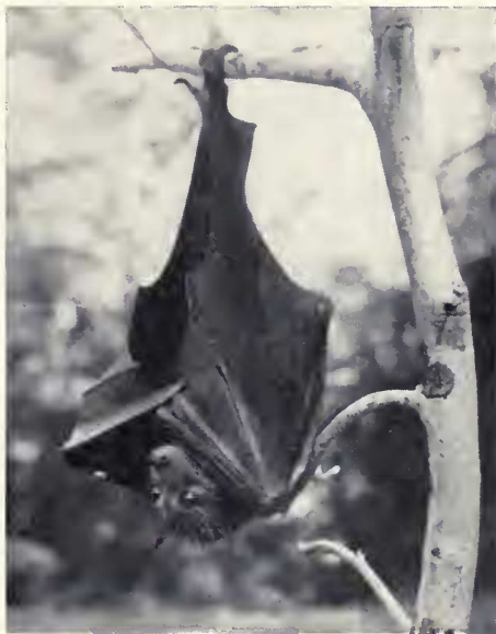
FIG. 79. Normal resting position of Pteropus ornatus , New Caledonia.

Measurements (5 adult males, 3 adult females).—Forearm 153–167.8. Skull: greatest length 70–72.8; condylo-basal length 67–69.5; palatal length 34.9–36.6; interorbital width 8.6–9.6; intertemporal width 6.2–8; zygomatic width 34.4–37.6; mastoid width 20.8–21.9; width of brain case 22.5–23.7; upper toothrow 25.3–27.3; width